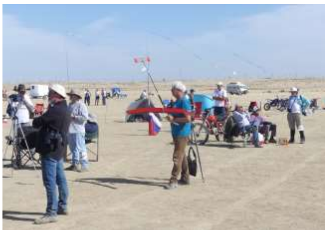
A typical F1B flight line scene – Didier Barberis waiting to fly, Gabby's food truck in the background

During the model processing the first round of F1B had started and it looked easy with models DTing from some height near the processing hut. 81 of the 96 competitors had maxed in the round, but round 2 was to prove more difficult with some gentle up and down air movements starting and the sky partly clouding over. It ended full scores for 21 people, including for the USA Alex Andriukov and Greg Simon and the entire British team with Mike Woolner dropping the least at 15 seconds below the max.